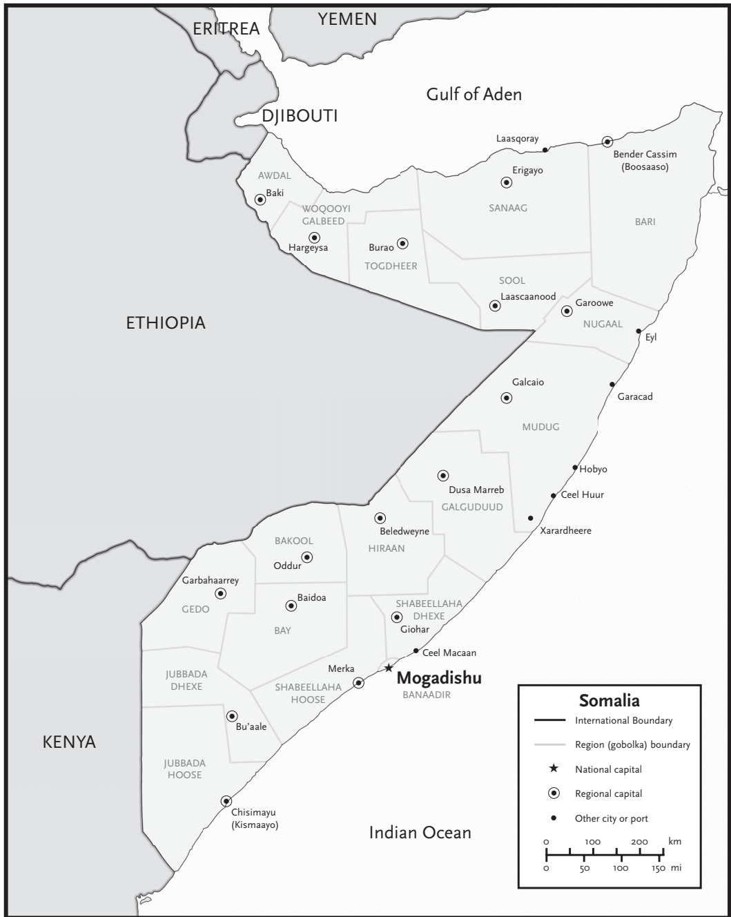
Figure 1: Map of Somalia

the international community bet on a policy of containment that worked efficiently thanks to Somalia's neighbors, especially Ethiopia. The bombings of the U.S. embassies in Nairobi and Dar es Salam in August 1998 and the attack on a hotel near Mombasa in November 2002 prompted a counterterrorist approach led by the Bush administration, which could accommodate regional interests. This policy can be