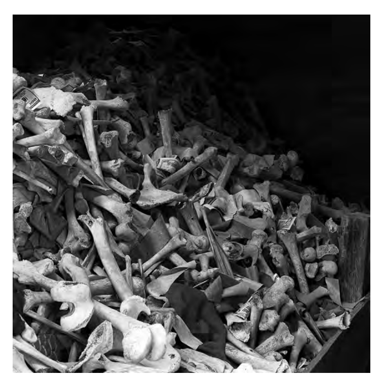
Unnamed killing field