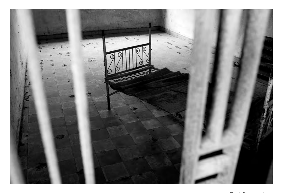
Tuol Sleng prison