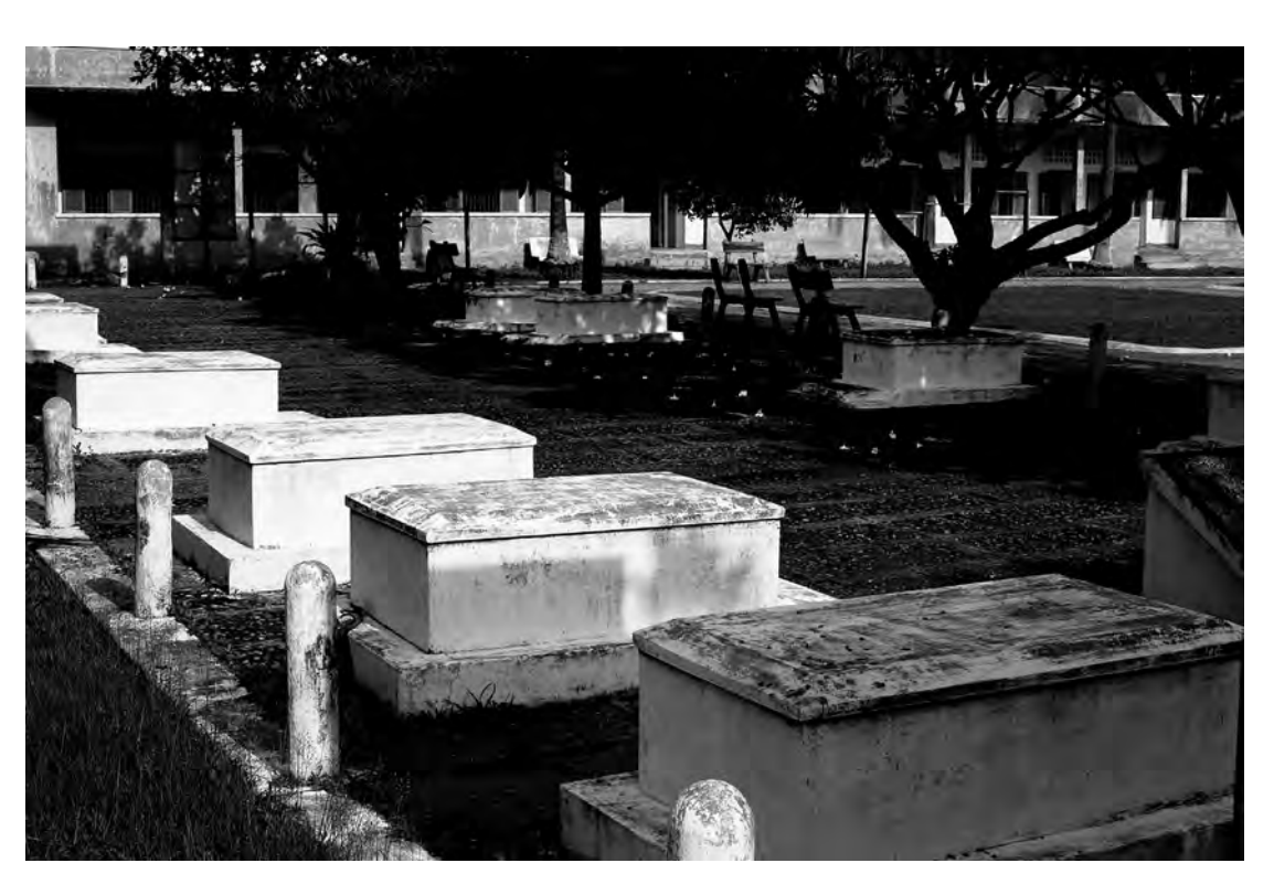
Tuol Sleng prison