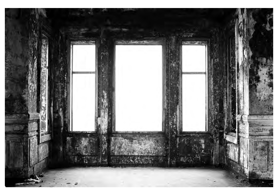
Bokor Hill Station