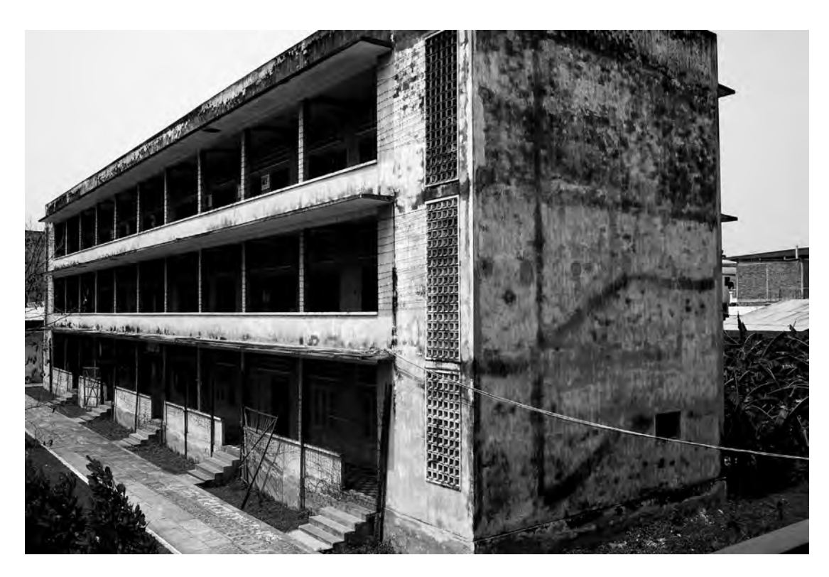
Tuol Sleng prison