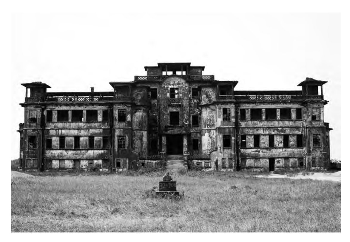
Bokor Hill Station