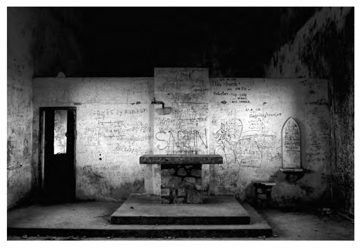
Bokor Hill Station