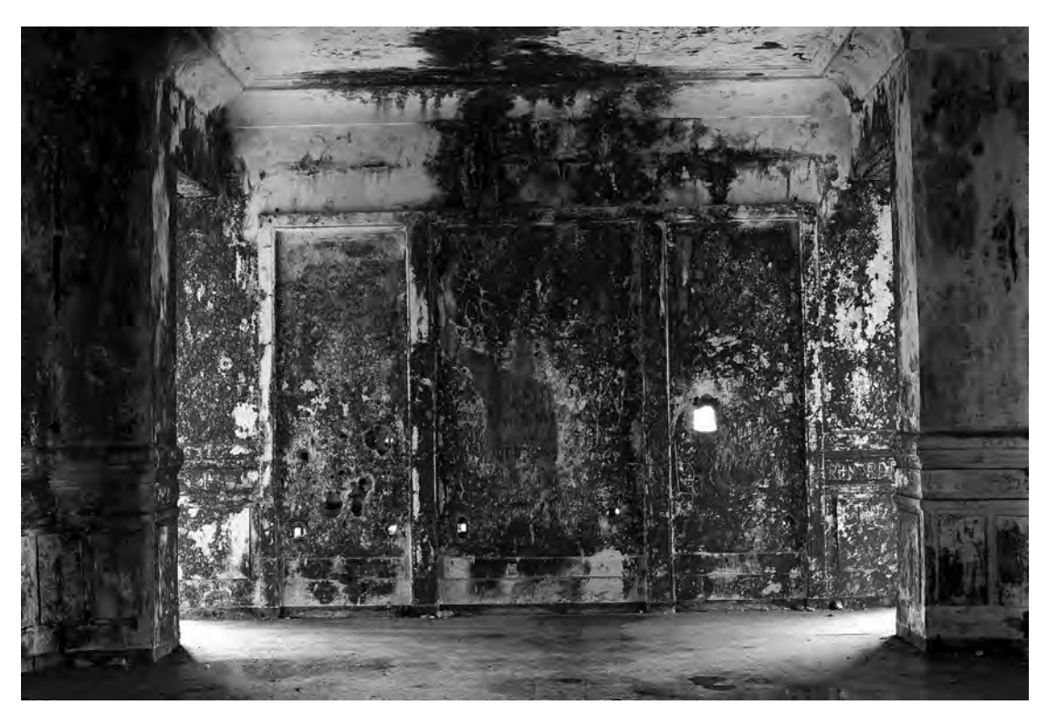
Bokor Hill Station