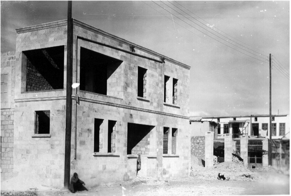
Fig. 3: A new home for a refugee family under construction, ca. 1930. Note the electrical service and the windows facing onto the street, both emblematic of the modern nature of this building project.

elsewhere . This must be avoided, and to avoid it we must make of them small-property owners, of a house, of land or of a field. This task is underway: what has been done in the Levant towards this goal does honor to the League of Nations . 42